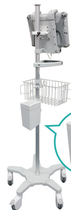
19V DC-output charges DT Research medical tablet