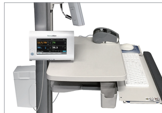
15V DC-output powers vital sign monitor