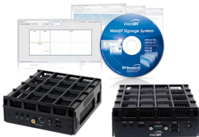
WebDT SA2000 and SA3200

The WebDT signage players and sensor devices are fully integrated with the center's automation control system for streamlined management from a central location. The control system is capable of remote shut-down, power-on, triggered video playback and sound from the signage players to the LCDs, TVs and projectors.