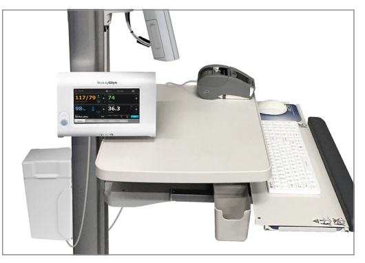
24V DC-output powers vital sign monitor