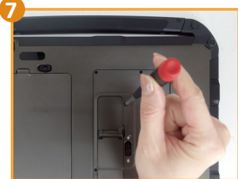
Lock the screw into the screw hole.