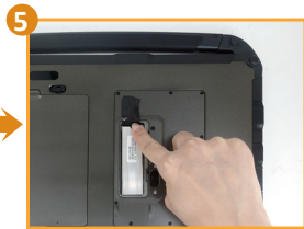
Fit another SSD into place.