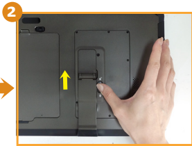
Slide the latch to unlock the SSD door.