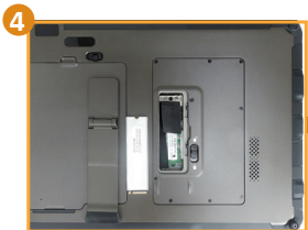
Lift the SSD off the compartment