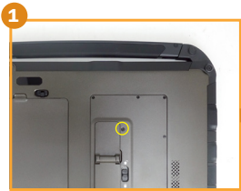
Loosen the screw on the back side of the tablet.