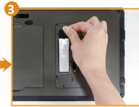
Pull the tape on the top of the SSD door to loosen the SSD.