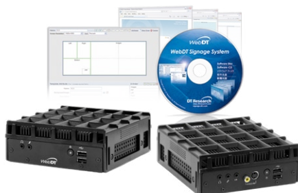
WebDT SA2000 and SA3000

Beijing Xingguang Film & TV Equipment Technologies